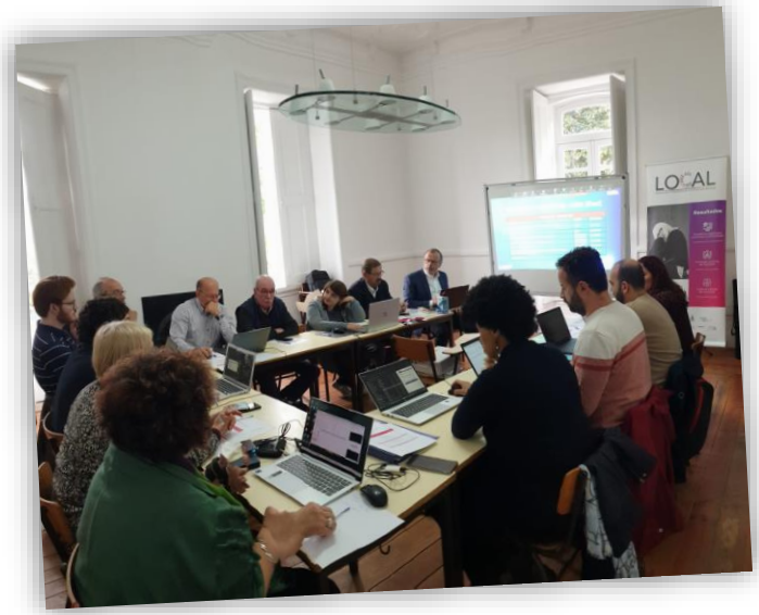
Multiplier Event in Castelo Branco (PT)

During the last months of project's implementation, partners carried out Multiplier Events to reach stakeholders and policy makers to mainstream the LOCAL resources.